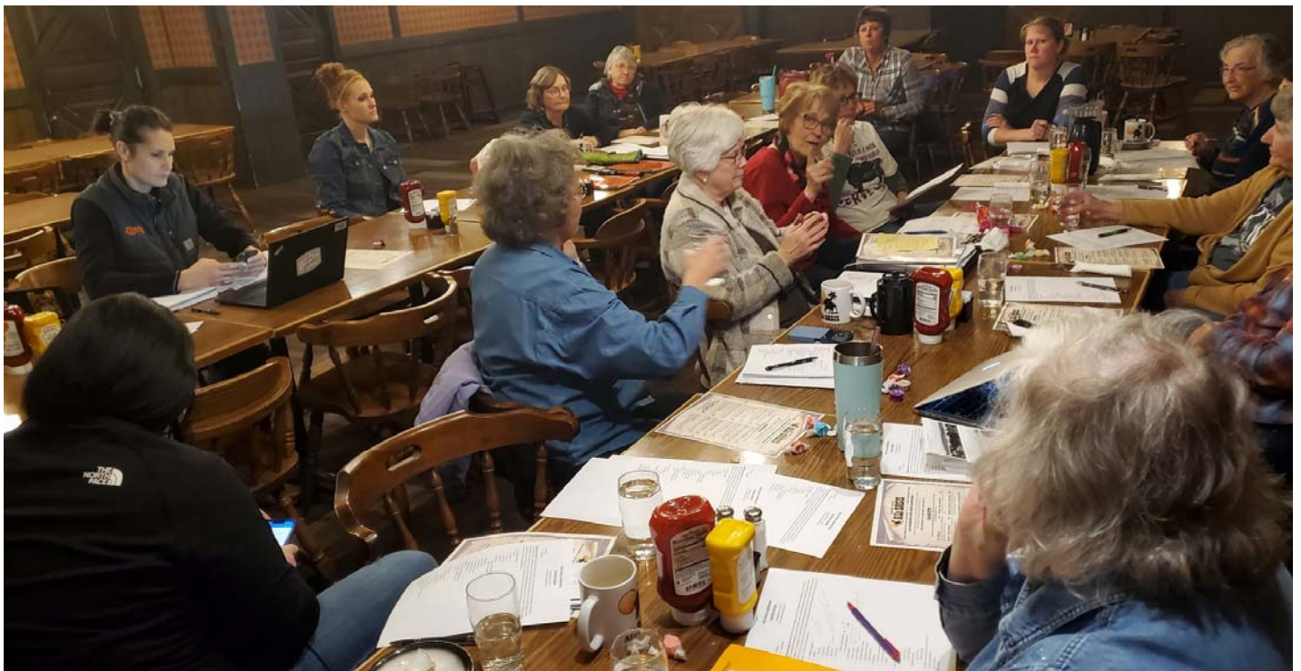
A large crowd of SDCW members attended the meeting in Chamberlain Feb. 8

It is May - Beef Month! Share a photo in our photo contest celebrating BEEF Month! Simply post your photo on our Facebook page as you “Tell Your Story”