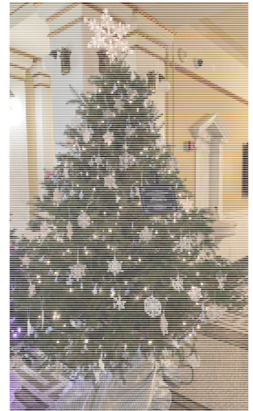
South Dakota CattleWomen's Christmas Tree for 2023 Christmas at the Capitol