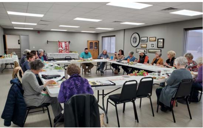
The SD CattleWomen gathered for the quarterly meeting