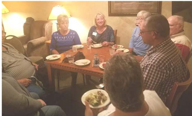
A few of the people that met the night before the annual meeting at the Ramkota in Rapid City, enjoying some snacks and visiting.